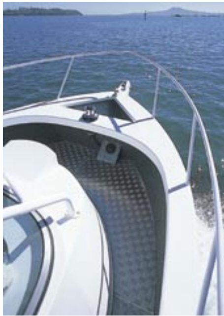
The Scorpion is a true walkaround with useful space in the bows.