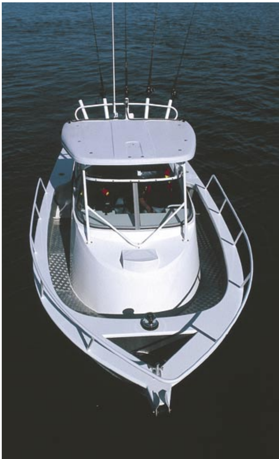
The walkaround side decks and foredeck are usable.

Black decided it was time for a dive and retreated to the bow to don his gear out of the way of the rest of us. This was the signal for a couple more good bites and a nice snapper, which had Black back at the stern in his wet-suit with rod in hand. Every time he made up