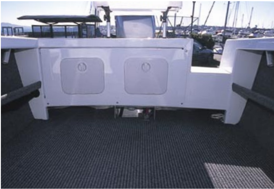
The layout is uncluttered and the cockpit is one of the biggest in the business.

Walkarounds are fishing boats, so that's what we thought we'd do with the 730: go fishing. Black also loaded some dive gear in case we got the opportunity to grab a few scallops. Laden with four adults, dive gear, fishing gear and a nearly full belly of gas, it was a realistic load for the boat.