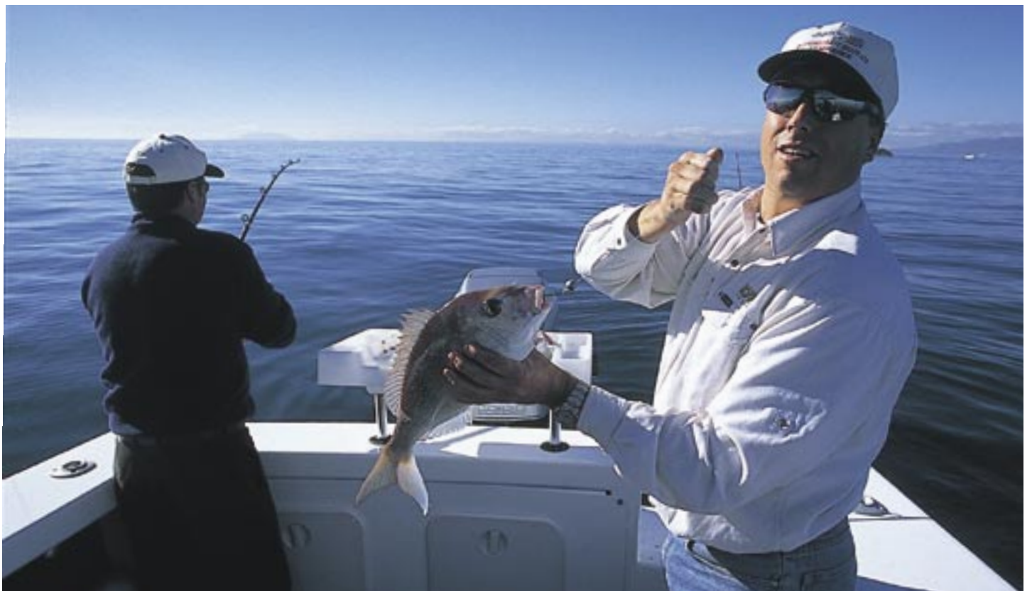
The second spot produced the odd snapper.

The cockpit is huge: 2.5m long from the back of the seats to the transom, ideal in a fishing boat. Scorpion has handled the transition up to the side-deck well, with a single wide step, under which proved a useful spot to store our tackle boxes. The alloy floor is self-draining through generous scuppers aft; it's covered in washable, loose fitting marine carpet designed for easy removal and cleaning after fishing, and the wide coamings make good seats while fishing. There are sealed flotation chambers running fore and aft under the floor all the way to the bow with the 180L fuel tank making up a third sealed chamber between the two.