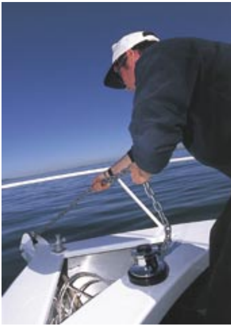
Working the ground tackle is easy on a walkaround.