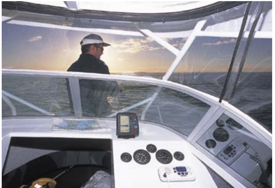
Jamie Black fishes from the bow after the tide changed.

On the other hand, the 730 is a lot of boat