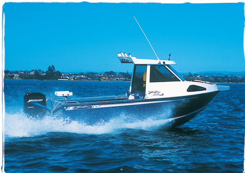
Left: The Mercury pushed the 620 to 41.0 mph.

Sales of the Bluefin range have been good to date, and this year Sportcraft Boats wants to push the brand even more.