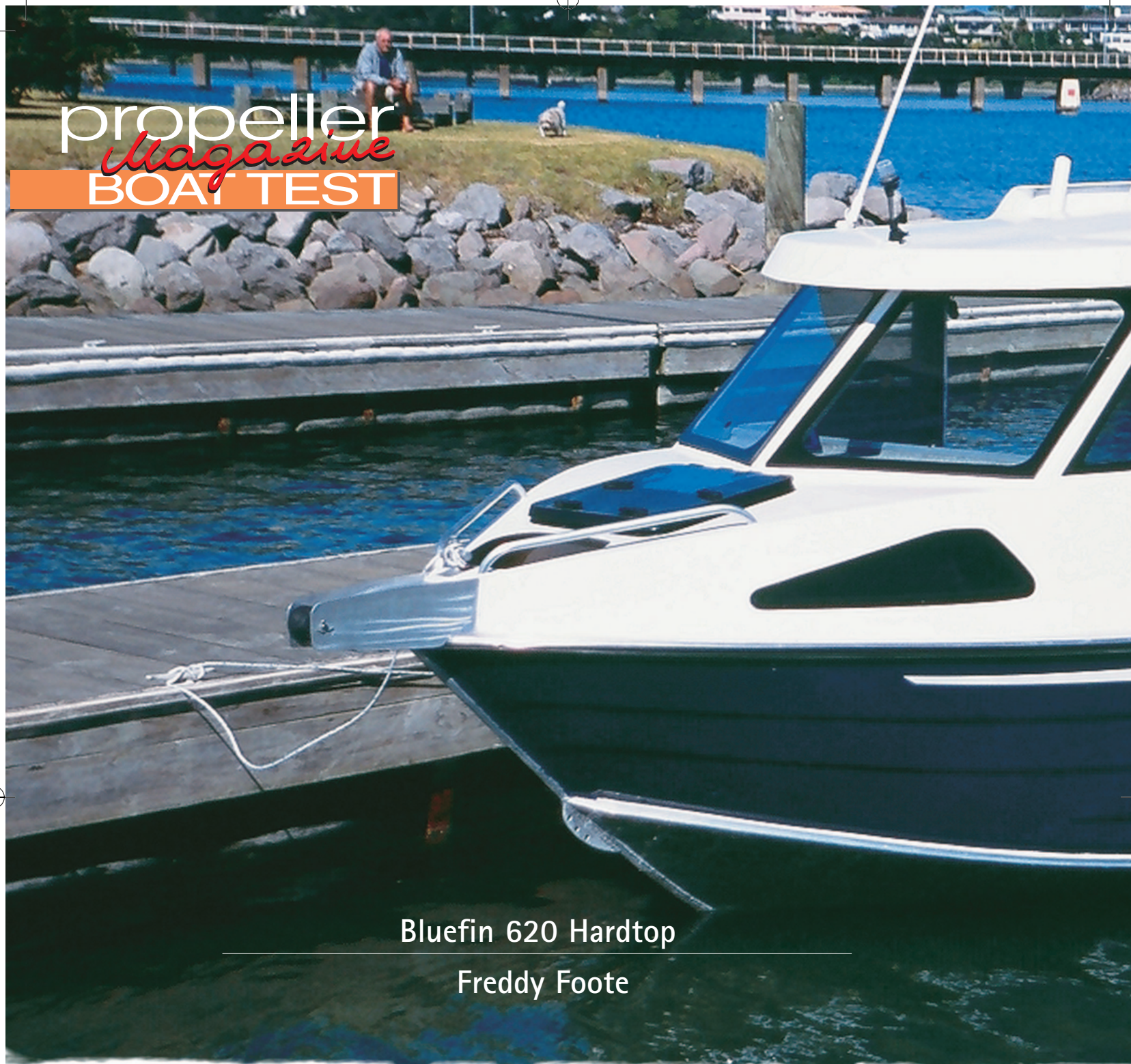
Bluefin 620 Hardtop Freddy Foote